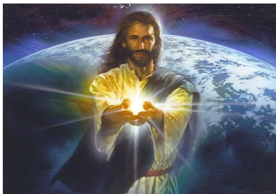
Jesus, the light of the world!

4. No matter what may be the test, God will take care of you; Lean, weary one, upon His breast, God will take care of you.